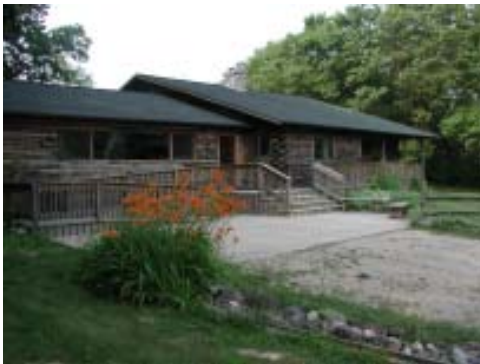
The Leaven Center Lodge

For additional information or to register online, visit www.leaven.org . You may also e-mail us at leavencenter@leaven.org , or call at 989/855-2606.