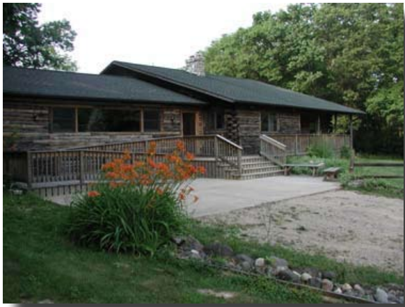
The Leaven Center Lodge