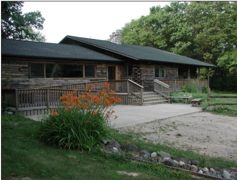
The Leaven Center Lodge

The workshop will be held at the Leaven Center Lodge. The main floor is barrier-free. The Leaven Center land has meditative paths that wind through meadows and alongside the Grand River. There is a spring-fed stream, a pond, and 1,000 feet of river frontage.